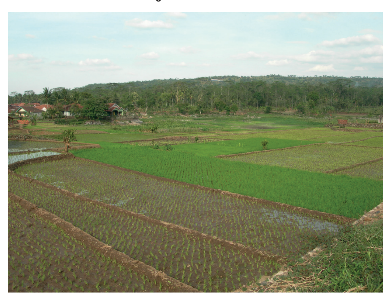
Fig. 5.4 for Question 5